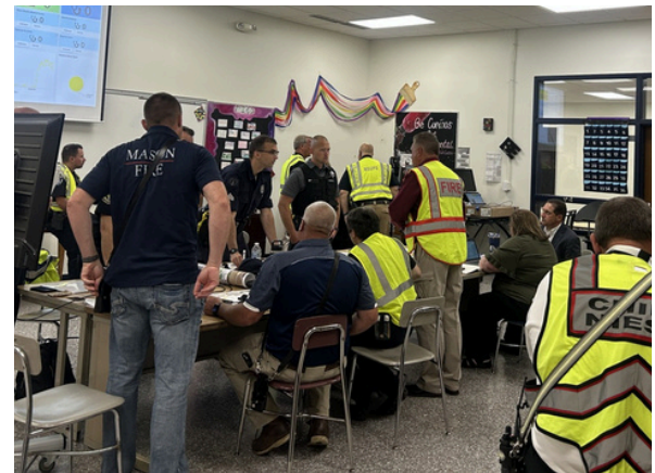
District leaders worked alongside local police and fire officials in a mock incident command scenario during the AVI.

Mason Public Schools would like to thank the dedicated law enforcement officers, firefighters, and emergency medical personnel who gave their time and expertise to make this training possible. Their partnership helps ensure our schools remain safe and prepared.