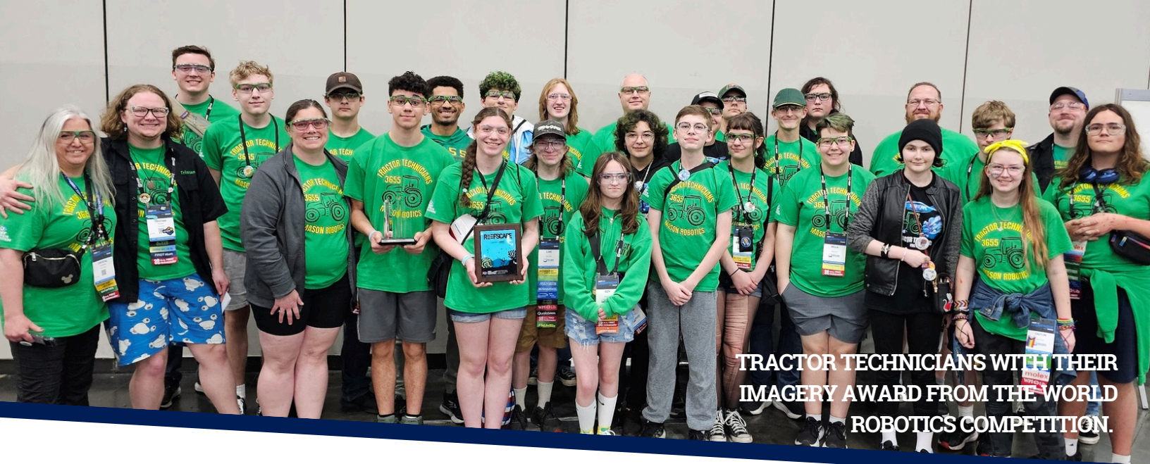
TRACTOR TECHNICIANS WITH THEIR IMAGERY AWARD FROM THE WORLD ROBOTICS COMPETITION.