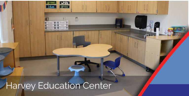
Harvey Education Center